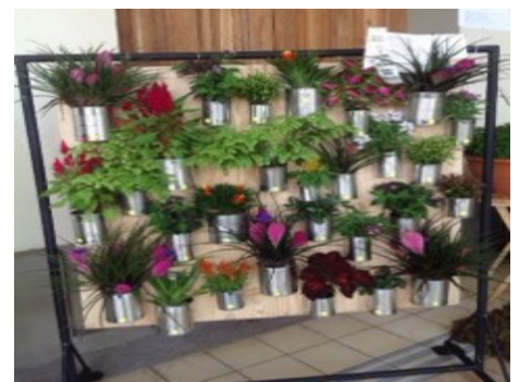
Vertical garden exhibit photos